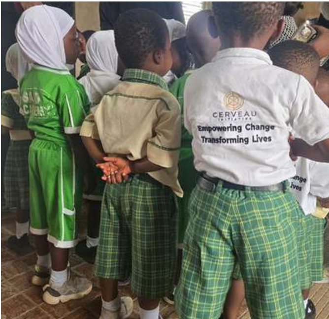
Our young student beneficiary of Sonne Scholarship