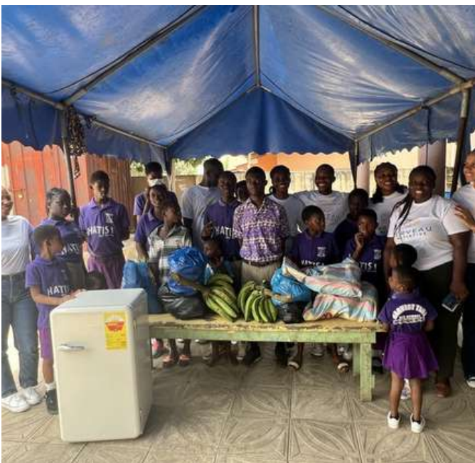
Food donation to an orphanage