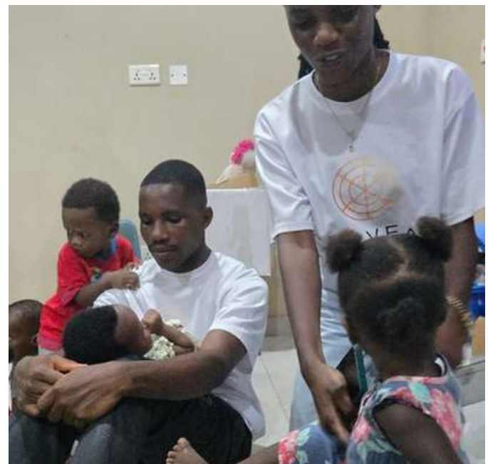
Visit to a nursery with volunteers