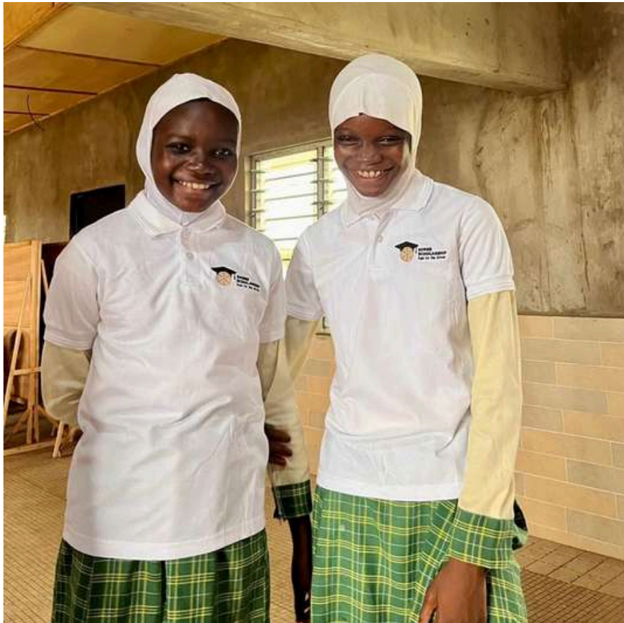
Young beneficiaries of our Sonne Scholarship programme

Sometimes, a smile is a gentle resistance. A way of saying: I'm still here, and I still believe. And in its simplicity, it becomes a precious reminder that hope, even silent hope, is already a victory.